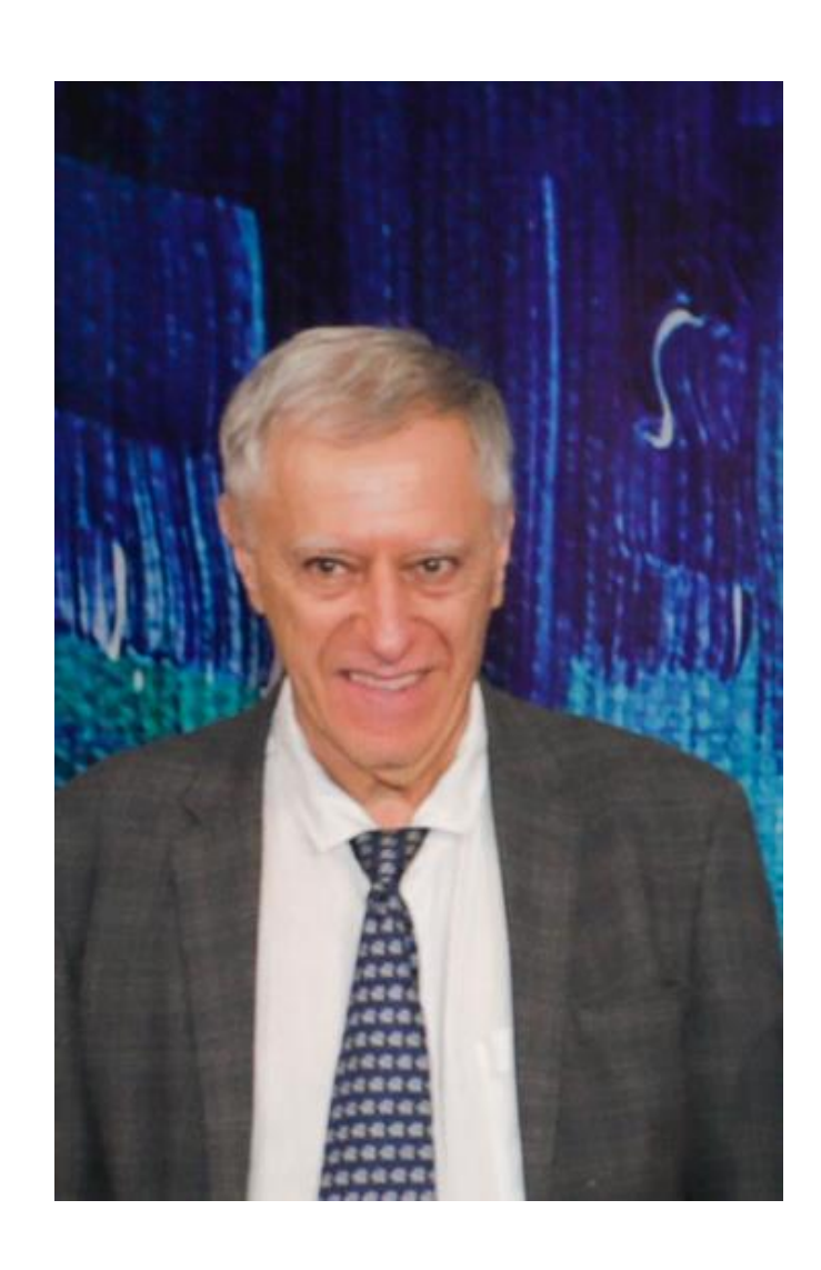
Le Lezard Bleu